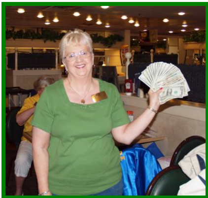
A Familiar Picture