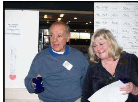
Now This Is a Program