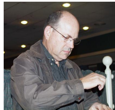
Hiding from Handshakers